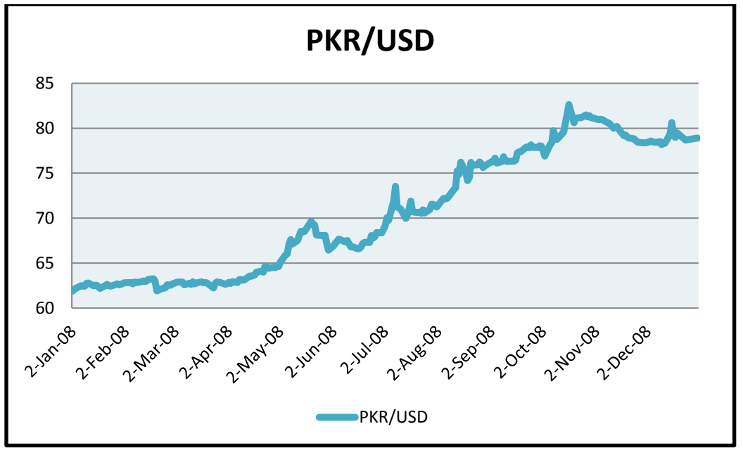
Figure 1: Parity of PKR to USD during the period January 01 to December 31, 2008

Depreciation of Pakistan Rupee also led to capital flight. From April 2008, foreign portfolio investment in our stock market kept falling, coinciding with the fall of the KSE Index. The sharp fall in the value of Pak Rupee against US dollar in 2008 is indicated in Figure 1. Rapid devaluation of Pakistan Rupee while reflecting worsening macro-economic situation further exacerbated it in many ways. It increased debt servicing burden of the country as well as increased exchange rate risk for the foreign investors.