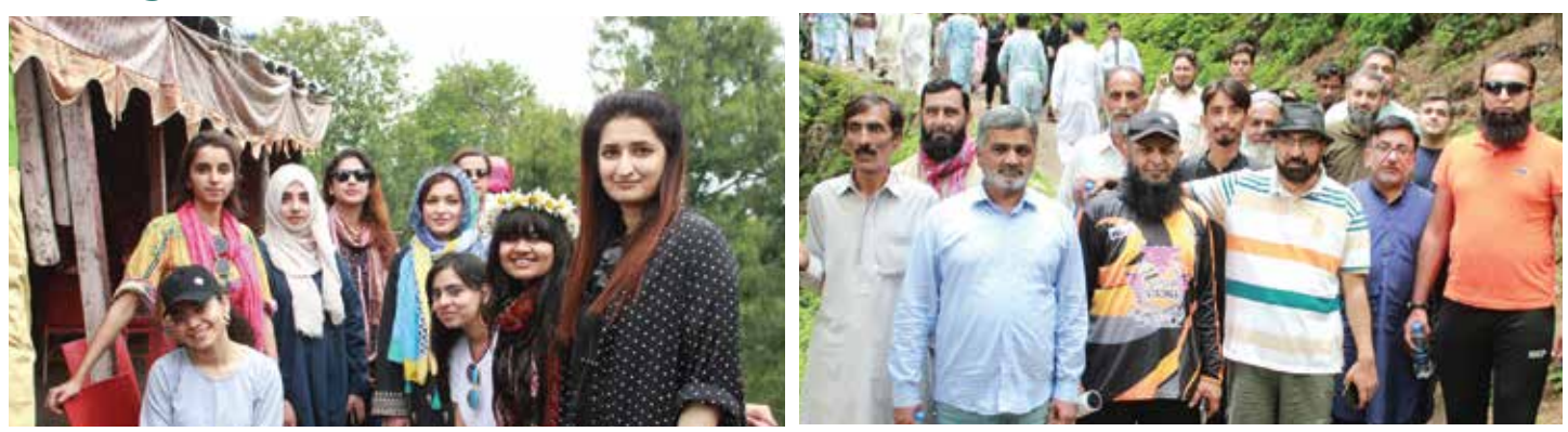
SECP team members took a hiking trip to Ayubia National Park, Ayubia, Murree on Saturday, June 17, 2023