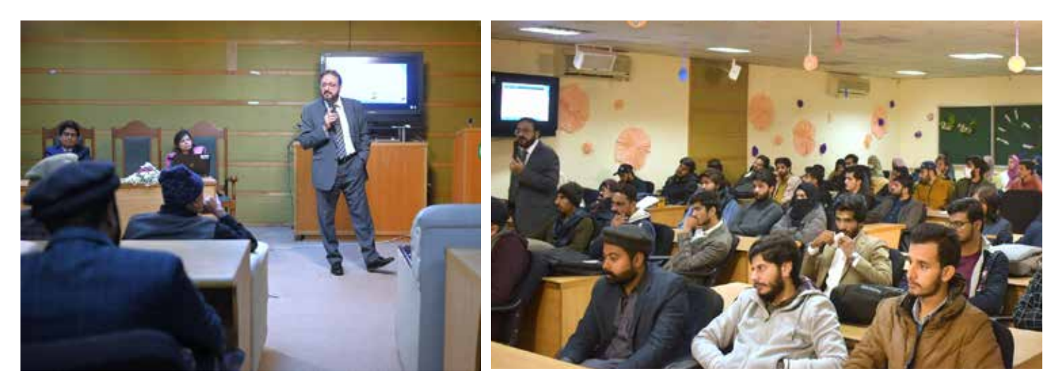
SECP's CRO Islamabad organized a seminar on "Role of SECP, Registration of a Company & Post incorporation Compliances" at ARID Agriculture University. Participants from BBA and IT departments of the university attended the seminar. (Islamabad, January 19, 2023)