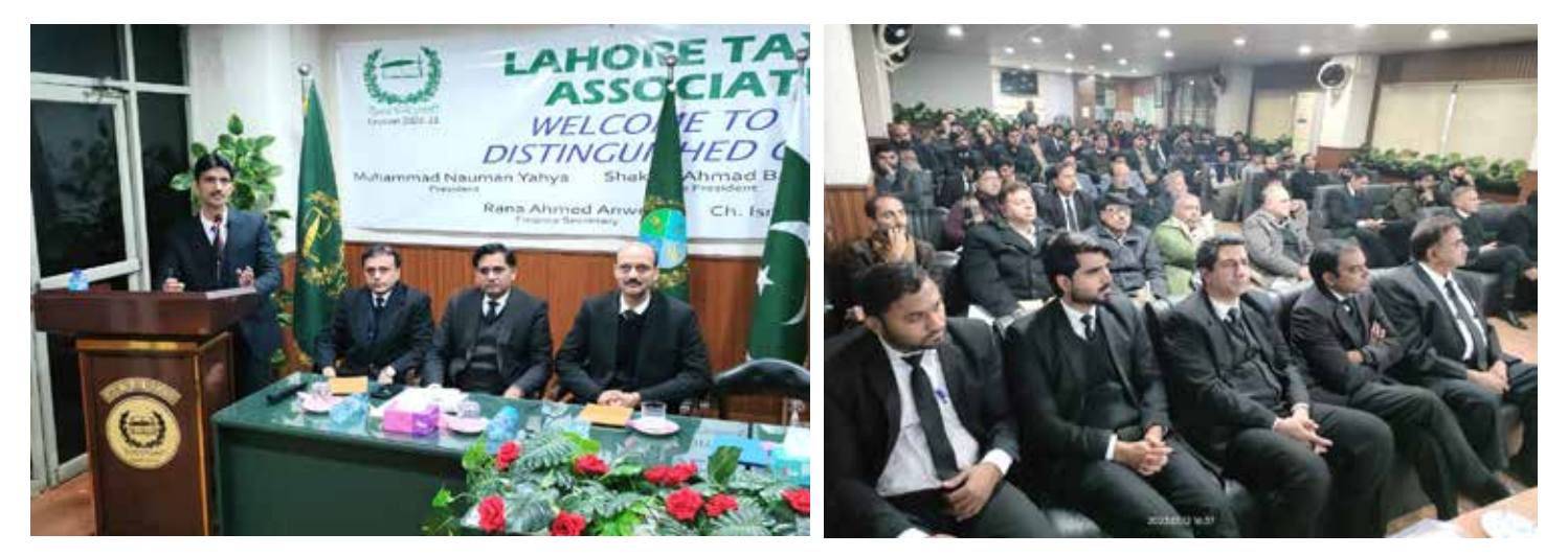
SECP's CRO Lahore organized a seminar on "Proposed Companies Regulations, 2022 & Company Registration" in collaboration with Lahore Tax Bar Association and briefed the participants about SECP's initiatives for Ease of Doing Business. (Lahore, January 17, 2023)

SECP's CRO Karachi gave a presentation on registering companies online to Federation of Pakistan Chambers of Commerce & Industry's (FPCCI) Standing Committee on Women Education. The event was focused on SECP's reforms and initiatives to facilitate women in the corporate sector, including fully automated company registration process. (Karachi, April 14, 2023)