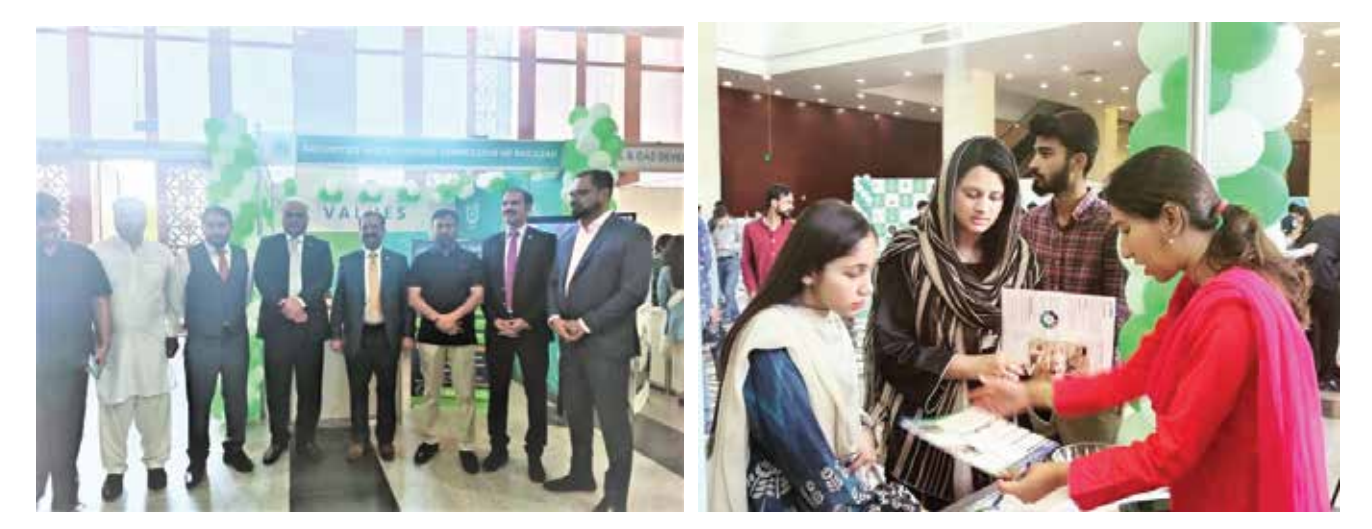
SECP participated in "HR Summit & Job Fair 2023 Exhibition" along with ICMA, organized at Pak-China Friendship Centre. (Islamabad, June 7, 2023)

SECP organized a workshop for lawyers at the request of Islamabad Bar Association, focusing on important regulatory aspects of SECP's role as a regulator. The session covered the scope and mandate of SECP, administered legislation, company registration and filings, etc. (Islamabad, June 2, 2023)